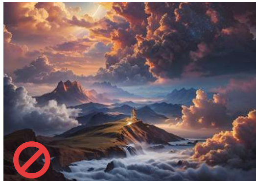
Artificial Intelligence (AI) images/artworks