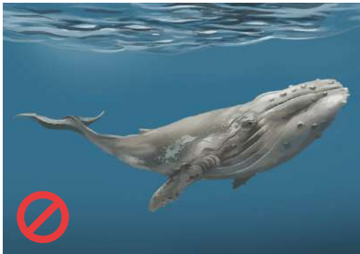
Less than 2000px in the widest edge