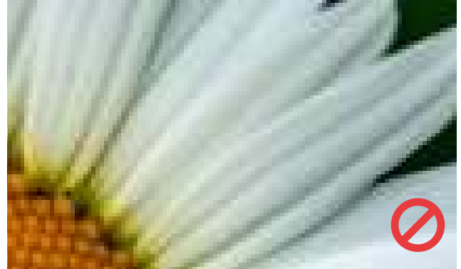
Low resolution (lost details) images