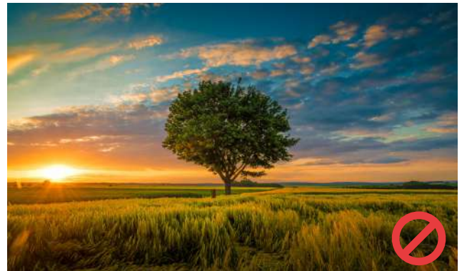
Use google/stock images